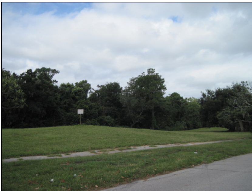
Property is undeveloped and bounded on the west and north by woods and wetland.

Source: Planning and Development Department Date: August 25, 2014